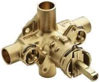
Commercial 1/2" Cc Connection With Integral Stops