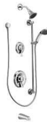
Commercial Transfer Posi-temp Tub And Shower - Chrome