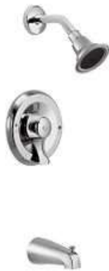
Commercial Posi-temp Tub And Shower - Chrome