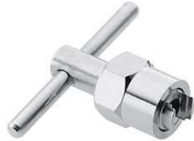
Cartridge Puller Qty: 2 List: $56.45