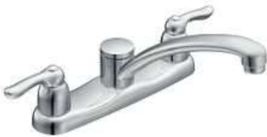
Chateau Two Handle Kitchen Faucet - Chrome Qty: 1 List: $164.85