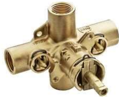
Commercial 1/2" Ips Connection With Integral Stops - Chrome