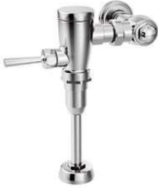
M-dura Manual Flush Valve 3/4" Urinal - Chrome Qty: 2 List: $198.30