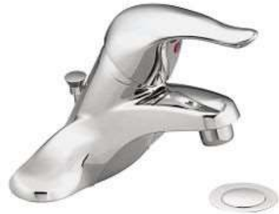
Chateau One Handle Bathroom Faucet - Chrome Qty: 2 List: $212.80