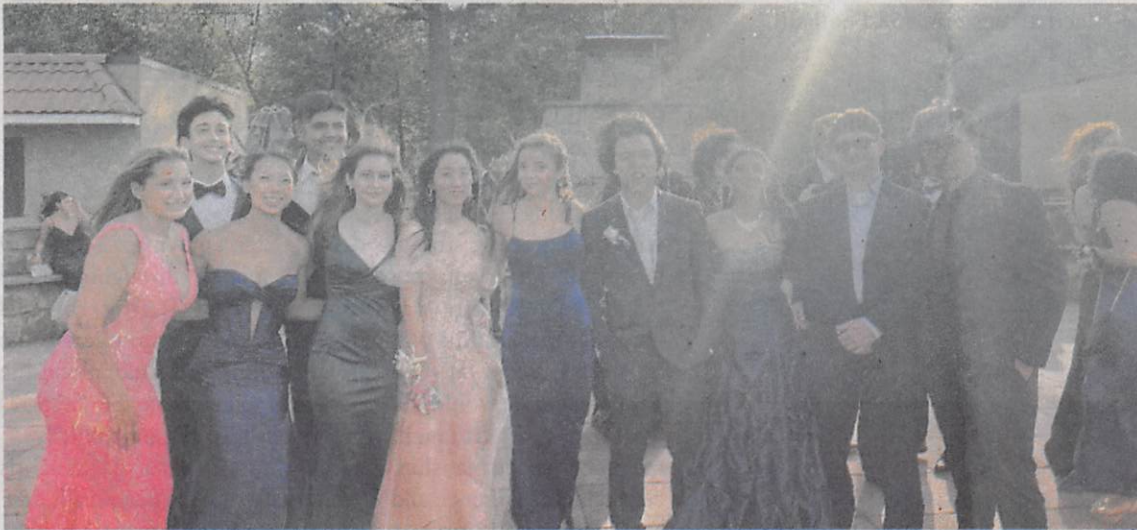
IIDT Seniors at Prom