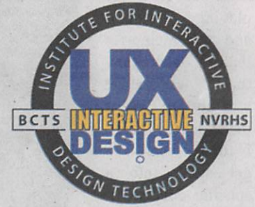
Logo of the IIDT program