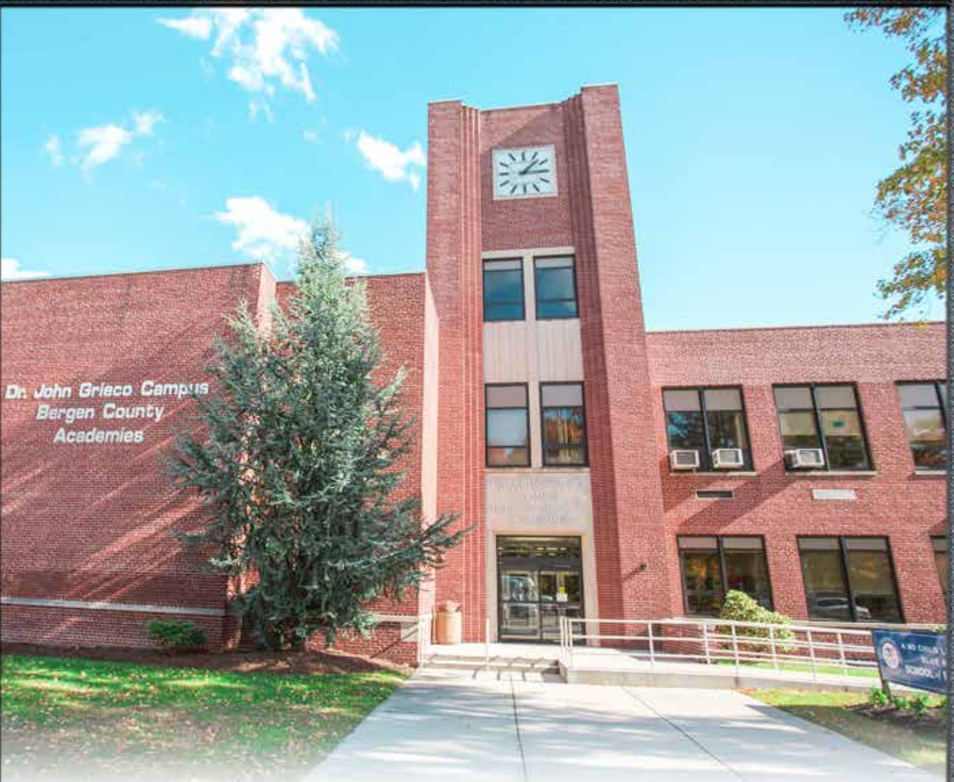
Dr. John Grieco Campus Bergen County Academies

AEDT • AAST • AVPA • ATCS • AMST • ACAHA • ABF • AEDT • AAST