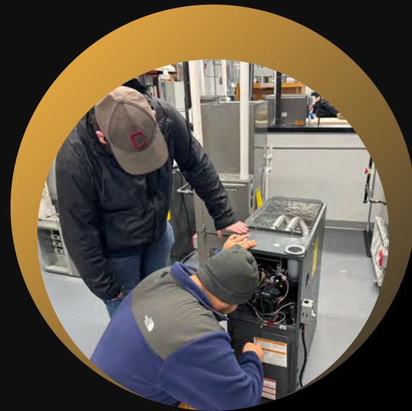
HVAC-R 1053 HRS (10 MONTHS)