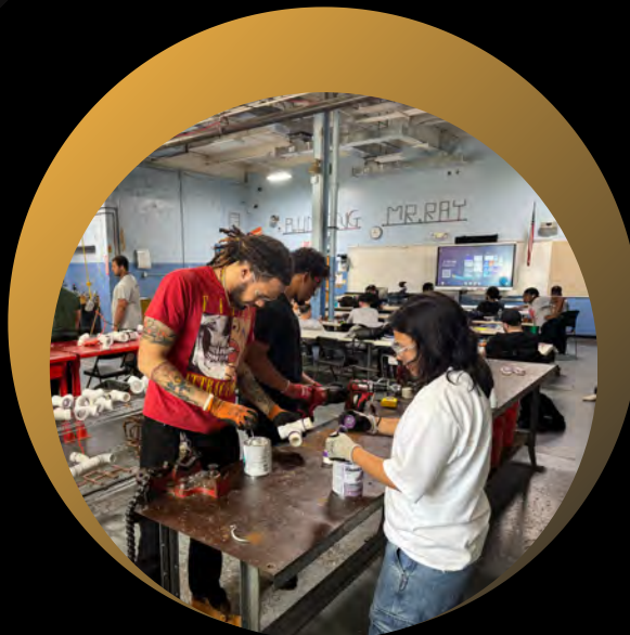
PLUMBING TECHNOLOGY/ PLUMBER 819 HRS (8 MONTHS)