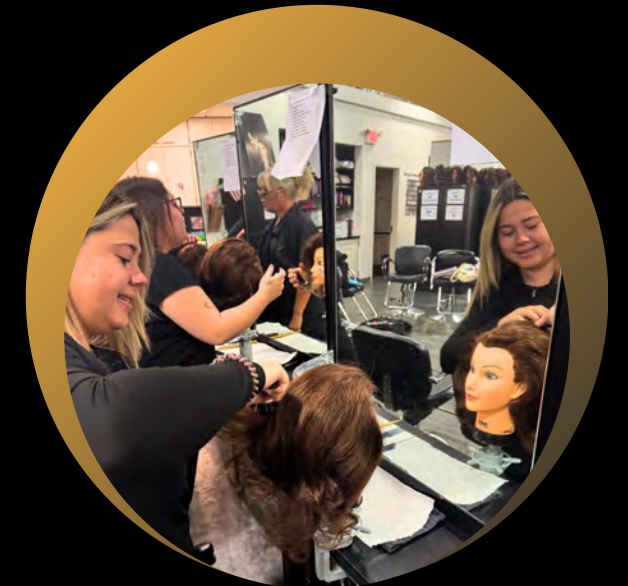
COSMETOLOGY (HYBRID) 1077 HRS (15 MONTHS)